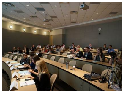
Above: Photos from the Intellectual Property Boot Camp held on October 17, 2012